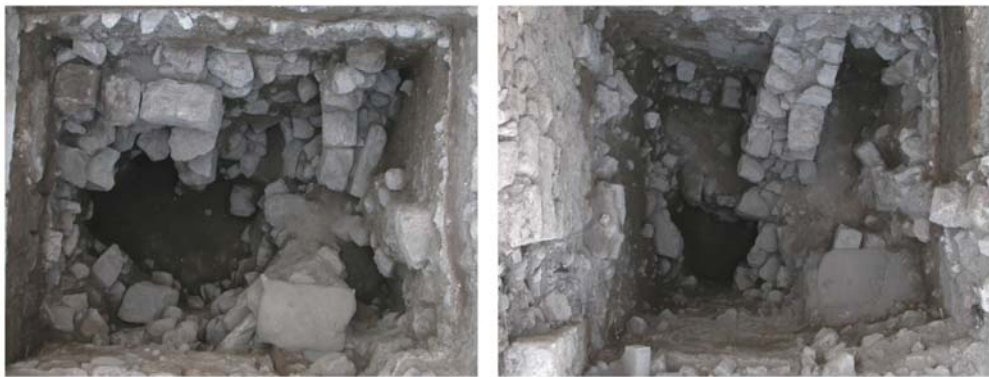
Figure 2 Easternmost Excavation Units