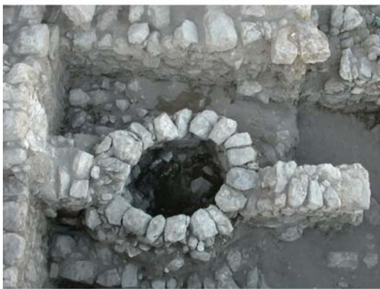
Figure 3 Early Roman/Nabatean Structures