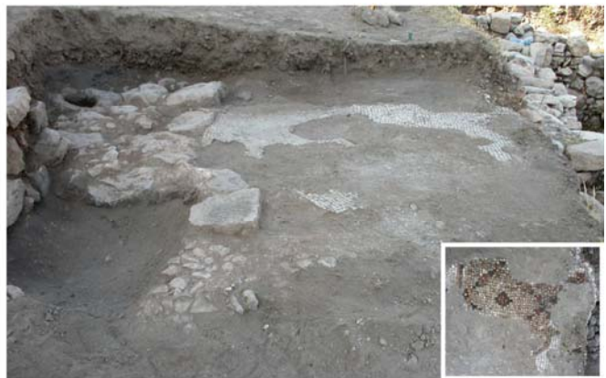
Figure 4 Byzantine Mosaic and Architecture